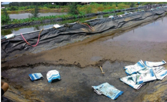
Figure 4. Harvesting clam seed.

pond are harvested and using the net to remove the clam seeds from the sand. On October 24, 2019, harvesting clam seeds in nursing ponds, there are 285 kg clam seeds with the size of 15,000 ind./kg (Figures 4, 5) in total of both ponds in which there are 220 kg reaching 62.8% in the pond No. 4, meanwhile only 65 kg reaching to 43.5% with survival rate in the pond No. 1.