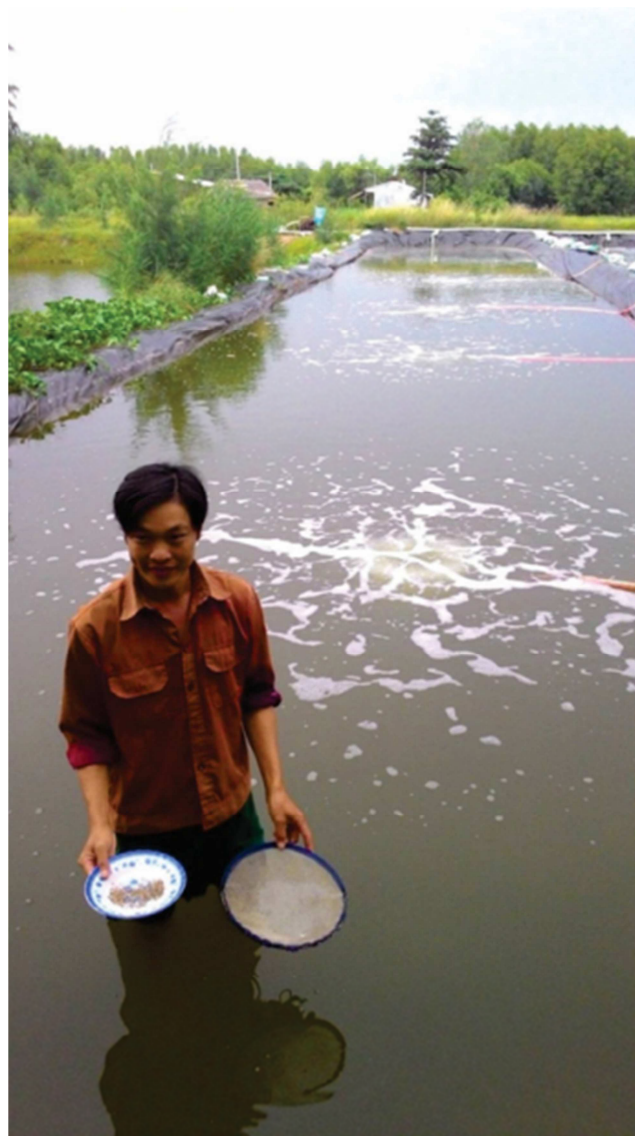
Figure 3. Nursing pond with oxygen supplementation.

At the same time spread an amount of new clean, fine sand on the nursing pond bottom, once a day. On September 7th 2019, all seed clams with size 45,000- 46.000 ind./kg from nursing ponds No. 2 and 3 were transferred to pond No. 4 with oxygen supplementation. The nursing pond has aerator to stabilize the nursing environment, increase the growth of clams and reduce the risk of clam seed death. Oxygen supplementation was studied during the model implementation (Figure 3). meanwhile, the pond No. 1 is taken care of normal condition without an oxygen supplementation.