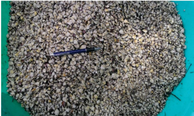
Figure 5. Harvesting clam seed in nursing pond with 15,000 ind./kg.

This experiment indicates that there are some damages occur in the nursing pond without oxygen supplementation and clam seed death is also detected in this period. Consequently, the survival rate is 43.5% to be low in comparison with 62.8% in the nursing pond with oxygen supplementation.