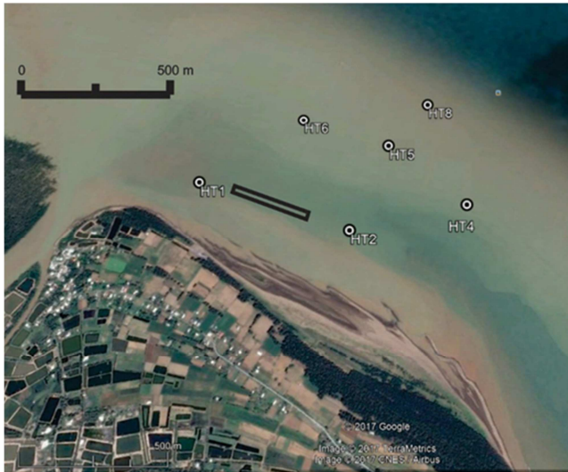
Figure 2. Clam seed nursing in the tidal flat and sampling locations.

second stage nursing on the tidal flats. Samples were collected at six stations (Figure 2) in the period of 06/2019, 11/2019 and 03/2020. Research on the ecological characteristics of water and sediment environments was conducted.