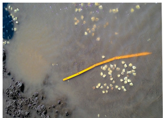
Figure 6. Harvesting clam seed in the tidal flat with 600 ind./kg.

The second phase of clam seed nursing in the tidal flat was completed with clam seed survival rate of 54.5%. All of clam seed is continued culturing to the commercial clam production on the same ground of Thanh Dat cooperative.