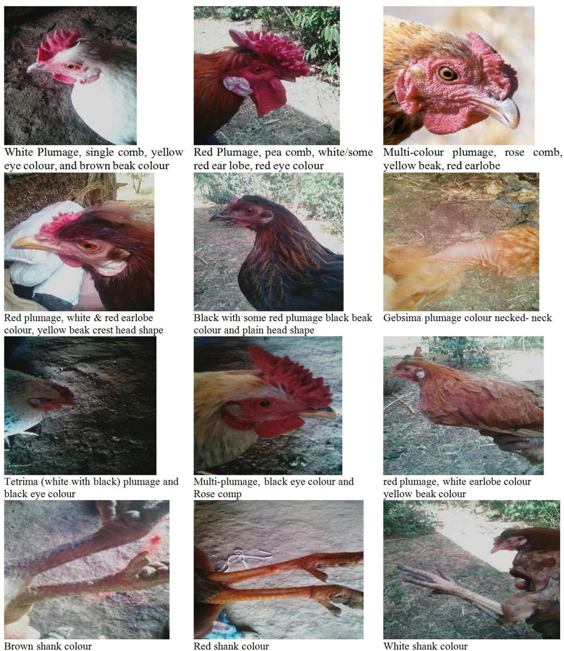
Figure 2. Phenotypic Variation of Indigenous Chicken.