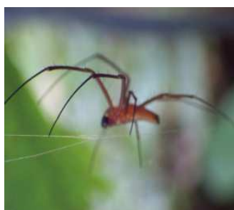
Figure 16. Nephila maculata (male).