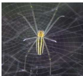
Figure 15. Nephila sp.