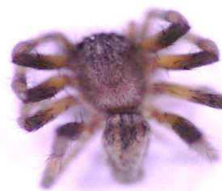
Figure 17. Clubiona sp.

Widely distributed from temperate to the tropical regions. At present there are 426 species recorded and 20 species were known in the Philippines [12]. This group usually found within the bushes [21].