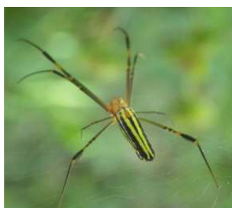
Figure 14. Nephila sp.