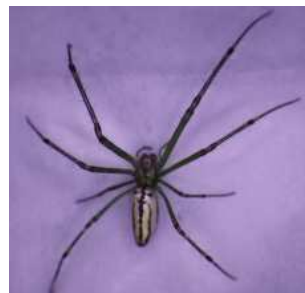
Figure 29. Leucauge sp.