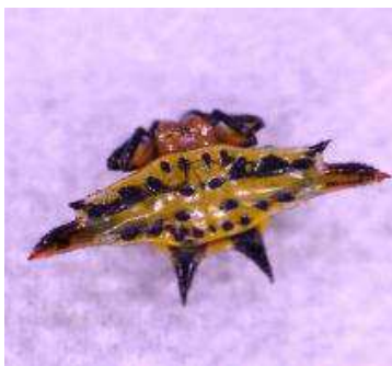
Figure 9. Gasteracantha sp.

Genus: Agriope The genus Agriope are widely distributed from the tropics