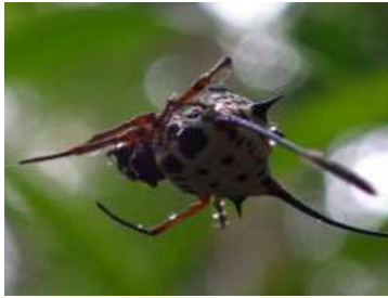
Figure 5. Gasteracantha janapol .