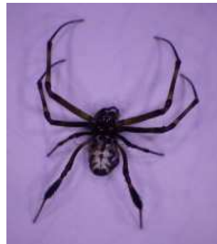
Figure 27. Leucauge argentina .