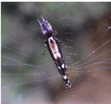
Figure 3. Cyclosa sp. 1.

The genus Cyclosa were known for their decorative design on their web as their camouflage to deceive the prey. They were distributed from temperate forest to the tropical region. [12] showed that there were 165 species worldwide and 22 species were found in the Philippines. These species preferred to build its web near the forest floor at the forest edge [10].