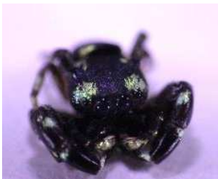
Figure 23. Heratemita sp.