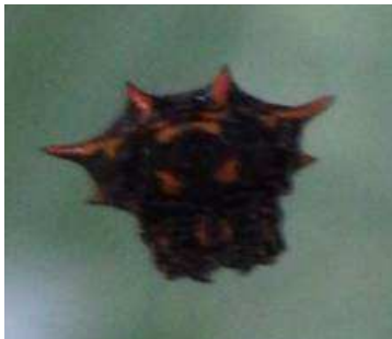
Figure 8. Gasteracantha sp.