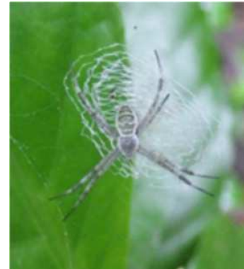
Figure 10. Agriope sp.

to the temperate regions. They are known for striking pattern on their abdomen and its zigzag form on their webs called the stabilimentum. In the Philippines, they are known as gagambang ekis ("X spider", again due to the stablementa). Worldwide there are 76 species recorded and 6 were found in the Philippines [12].