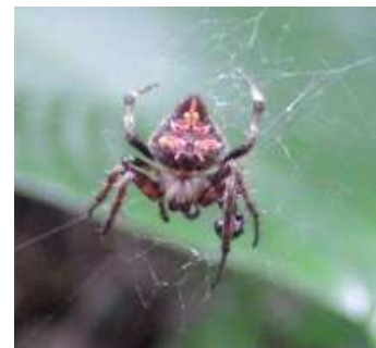
Figure 11. Neoscona sp.

The genus Neoscona are pantropical in distribution. Their abdomen has a distinguishing pattern and longitudinal groove on the carapace which separates all species which separates them from other species in Araneus . Worldwide there were 81 species and 11 were recorded from Philippines [12]. This group preferred areas with high prey density [20].