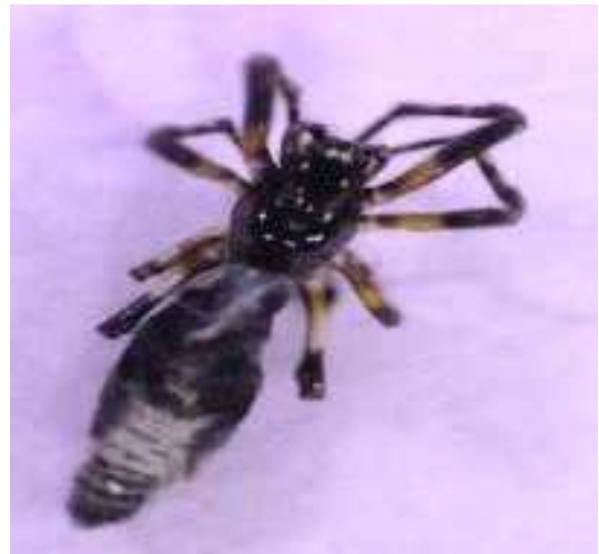
Figure 4. Cyclosa sp. 2.