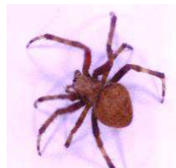
Figure 12. Neoscona sp.