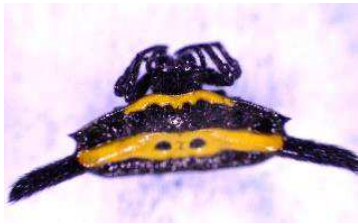
Figure 6. Gasteracantha parangdiadesmia .