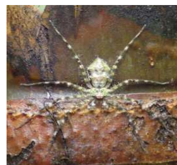
Figure 19. Heteropoda sp.