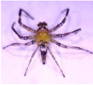
Figure 20. Epeus sp.