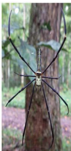
Figure 13. Nephila maculata (female).

the world, with species in Australia, Asia, Africa and America. This group of spiders preferred warmer condition of habitat. Old records that 105 species were recorded worldwide and 3 species were known in the Philippines [12].