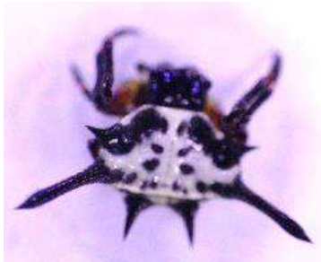
Figure 7. Gasteracantha sp.