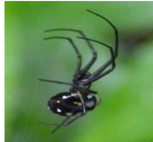
Figure 25. Leucauge argentina .