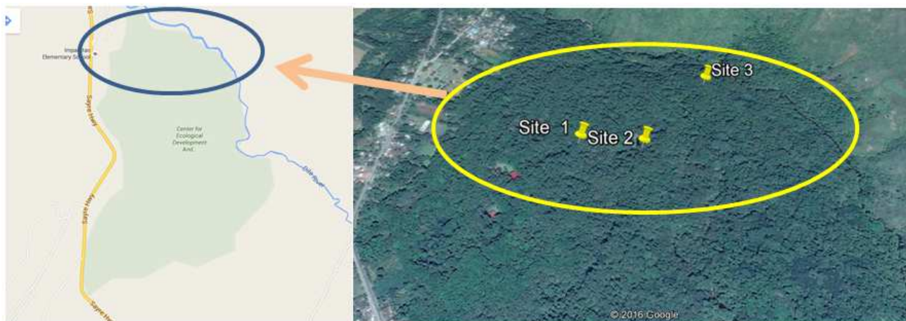
Figure 1. Site map of CEDAR, Impasug-ong, Bukidnon (left) and the sampling sites (right). (Google Earthpro).

forest. In the study, three sites were established, site 1 the roadside going the nearby stream, site 2 nearby stream and site 3 was along the mixed dipterocarp area. Site 1 was located 752m asl with a coordinates of N 08°15'8.00" and E 125°1.0'59.0". The area was quite open and along the side it consists of plants like palm species, some grasses, giant bamboo species, old growth trees and shrub. While site 2, was located 725m asl with coordinates of N 08°15'8.00" and E 125°2.0'5.0", near along the nearby stream which consisted of herbaceous plants, some ferns like Asplenium nidus , shrubs, Arum plants, giant bamboo species, few old growth tree and grasses. Then site 3, was located 743 m asl with the exact coordinates of N 08°15'17.00" and E 125°2.0'11.0", the area found between the Calatungan Falls and Dila Falls. It was composed of giant bamboo, some fern species like Pyrrosia species and young growth trees. The forest floor was filled with leaf litters and only few grasses and shrubs thrive in. All three sites were considered a disturbed habitat.