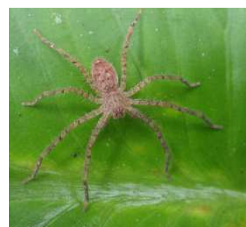
Figure 18. Heteropoda sp.

This main group of Sparassidae distributed in the tropical region of Asia and Australia. Worldwide there are 209 species and 2 were known in the Philippines. These are known foraging spiders, they don't built webs to capture prey but more or ambush type of strategy [12].