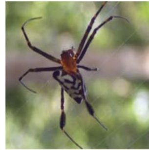
Figure 26. Leucauge venusta .