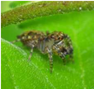
Figure 22. Chalcotropis .