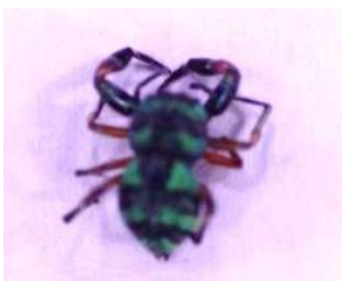
Figure 24. Heratemita sp.