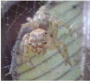
Figure 21. Chalcotropis sp.