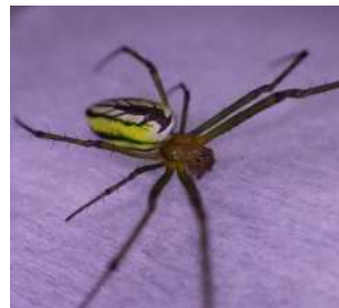
Figure 28. Leucauge sp.